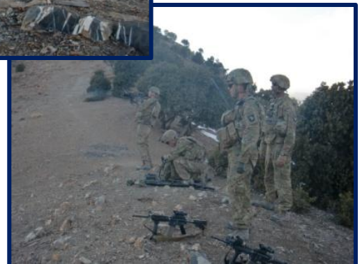
SSG Becker and SSG Jourden (lower right) supervise Soldiers from 1 st Platoon conduct weapons training at FOB Tillman.