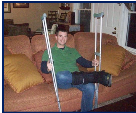
CH Vineyard suffering through intense pain