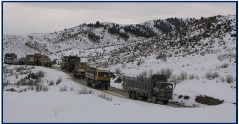
Our new 4 th Platoon takes a trip up to Zerok in the snow. The route was bad enough that they ended up stuck for 3 additional days waiting for a break in the weather!