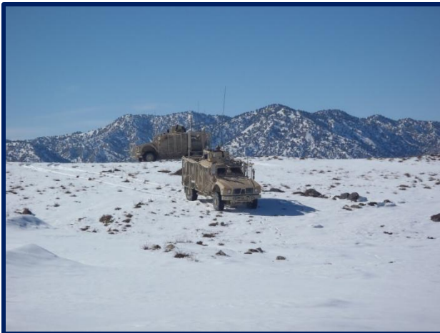
Snow can't stop these two W Co trucks being driven by SPC West and PFC Wolf.. In truth, both trucks got severely stuck shortly after this picture was taken.