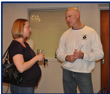
CSM Menton meets with a White Currahee spouse after the meeting

If you are traveling out of town, please send Monica your travel dates and the address where you will be located, just in case of emergency.