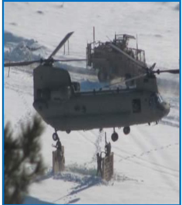
SFC Cardwell, SSG Baker & SPC Kinnamen display their sling-load skills to onlookers in MATV's.