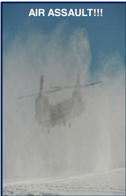
CH-47s land after a winter snow storm at FOB Boris