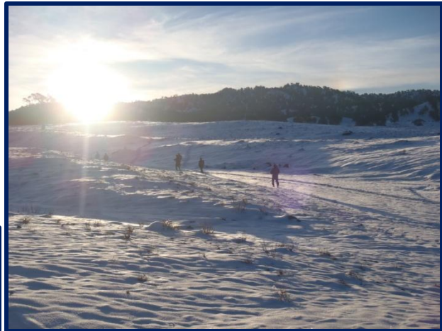
Another Whiskey Company cold winter's patrol at dawn