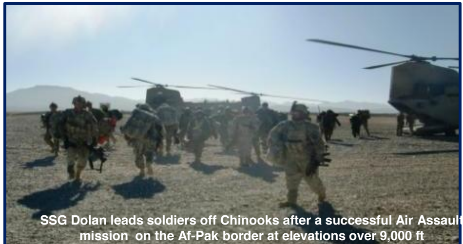
SSG Dolan leads soldiers off Chinooks after a successful Air Assault mission on the Af-Pak border at elevations over 9,000 ft