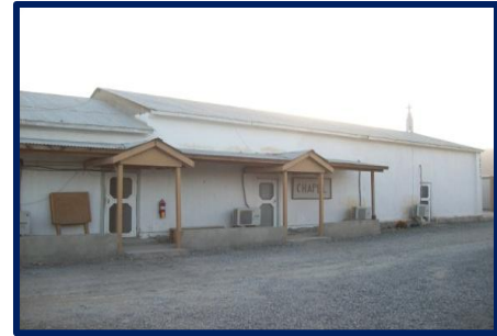
The FOB Orgun-E Chapel

A Continued Challenge... As I have briefed many of the Soldiers in the battalion over the past months, I have used my 'Wheel of Wellness' (picture to the left). I challenged you back in December to set some goals related to your mental, physical, emotional, and spiritual well-being. If we do this it helps us to 'roll' correctly. So let me ask, how are you 'rolling?' That is how are you doing with these goals? If you don't have any goals, it is never too late to start! I will be posting my article about the 'Wheel' on our BN Facebook account for anyone who might be interested in reading more. God bless!