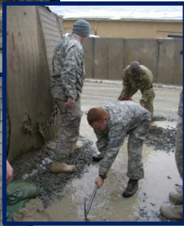
The HQ Section had to dig a trench to keep the office from flooding after the 1 st snow melt!