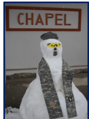
CH Frosty made the rounds