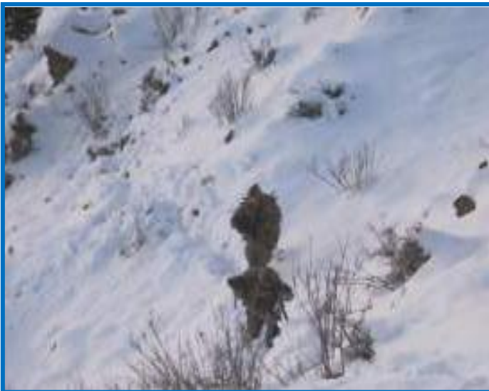
SSG Ruiz and SPC Funaro transporting the M240B up near-vertical terrain.