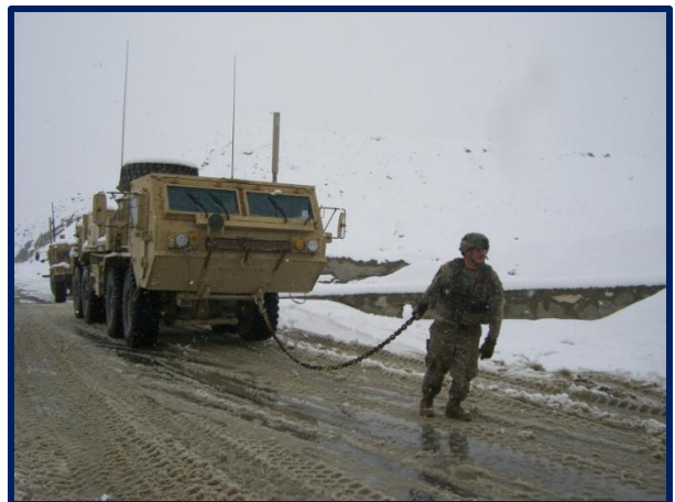
SPC Hughes prepares to single handedly pull a vehicle from the snow on a recovery mission!